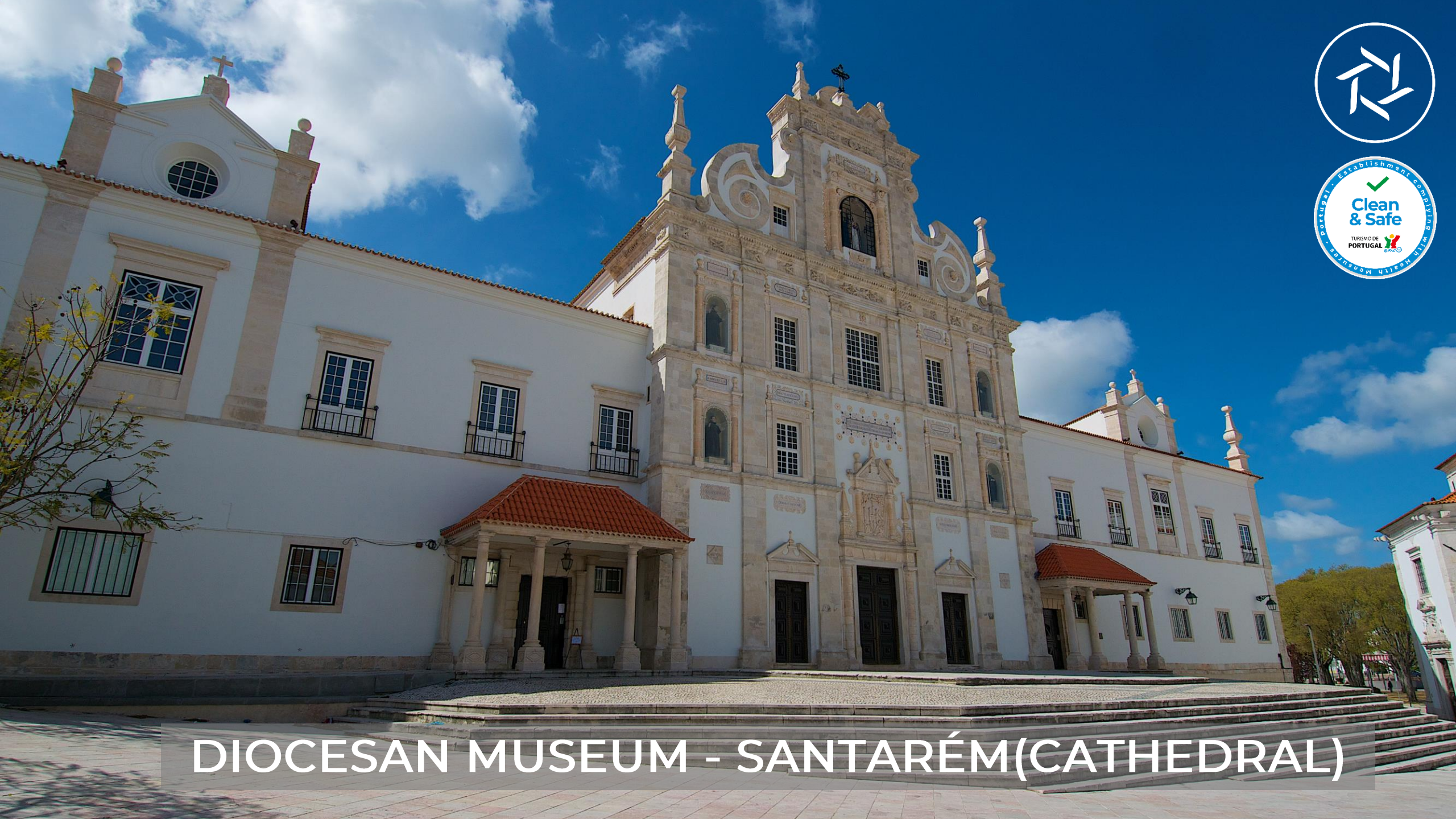
DIOCESAN MUSEUM - SANTARÉM(CATHEDRAL)